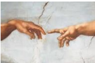
God is In Control

Luke 8:23+ But as they were sailing along He fell asleep; and a fierce gale of wind descended on the lake, and they began to be swamped and to be in danger.